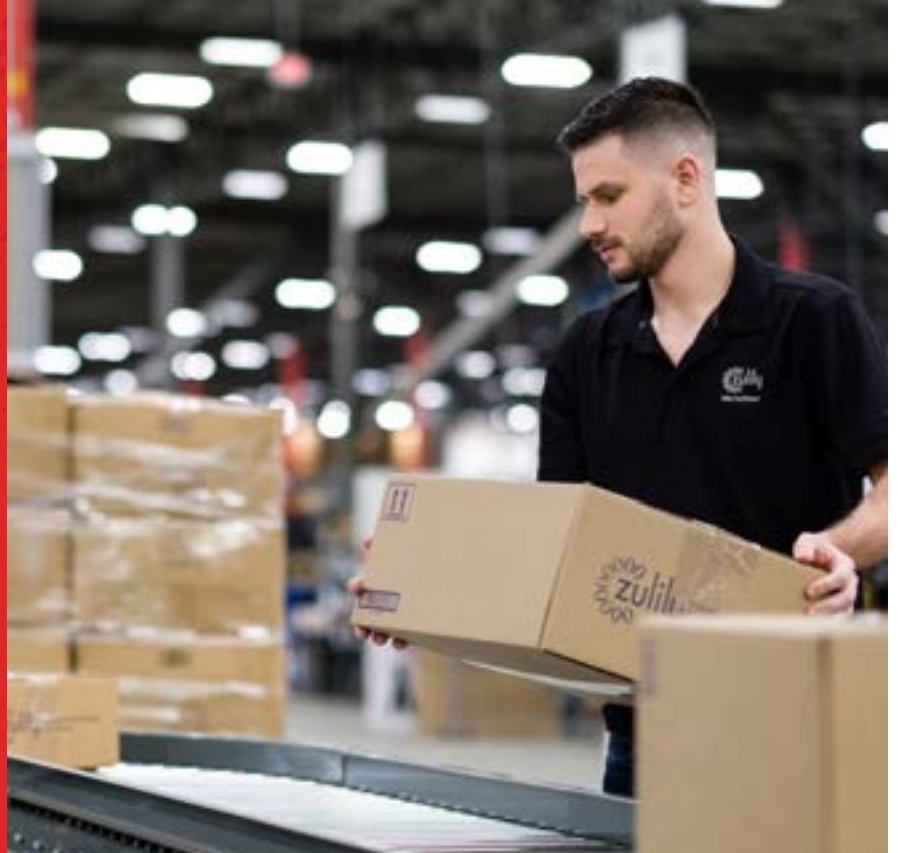
zulily in Obetz, Ohio.

With a diverse and extensive infrastructure, a central location close to customers, a qualified industry workforce and a thriving tech culture, Ohio is the best place for logistics and distribution companies to excel in a highly digital age.