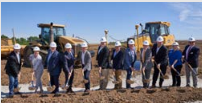
Groundbreaking at new Kroger customer fulfillment center.

Kroger's first CFC will be in its home headquarters region of Southwest Ohio and should be operational by spring 2021. Ohio has a strong food and agribusiness industry, an active tech environment and one of the nation's best infrastructures. For Kroger, this means it can deliver fresh foods fast to customers both near and far. For Ohio, Kroger's CFC reinforces the state's importance in logistics and tech innovation.