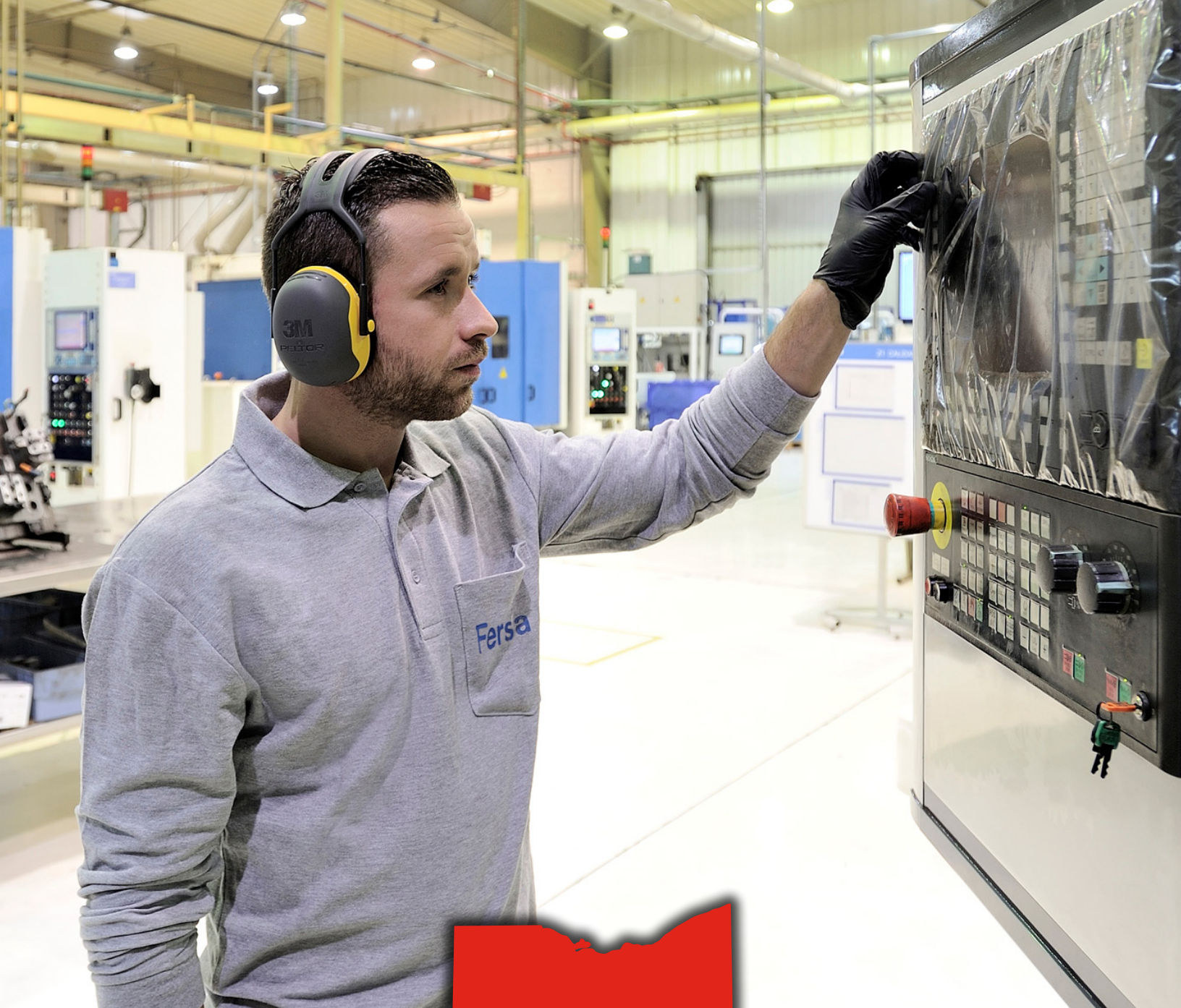
Fersa Bearings in Northwood, Ohio.