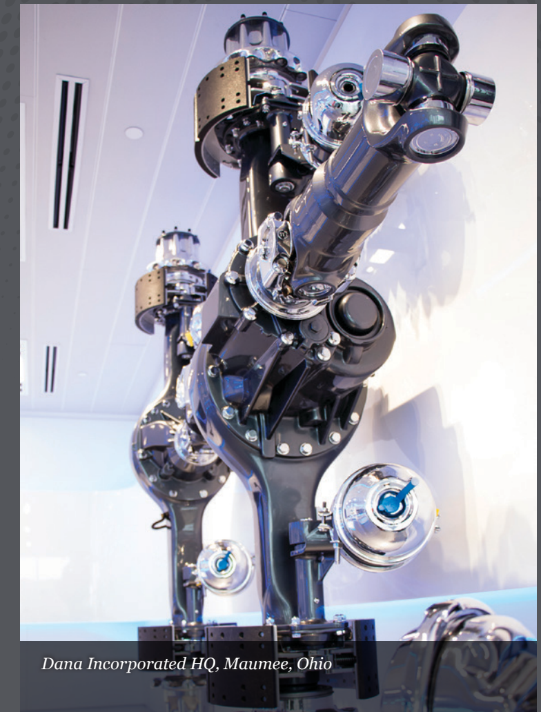
Dana Incorporated HQ, Maumee, Ohio